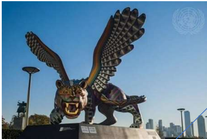
This statue was placed in front of the U.N. December 2021